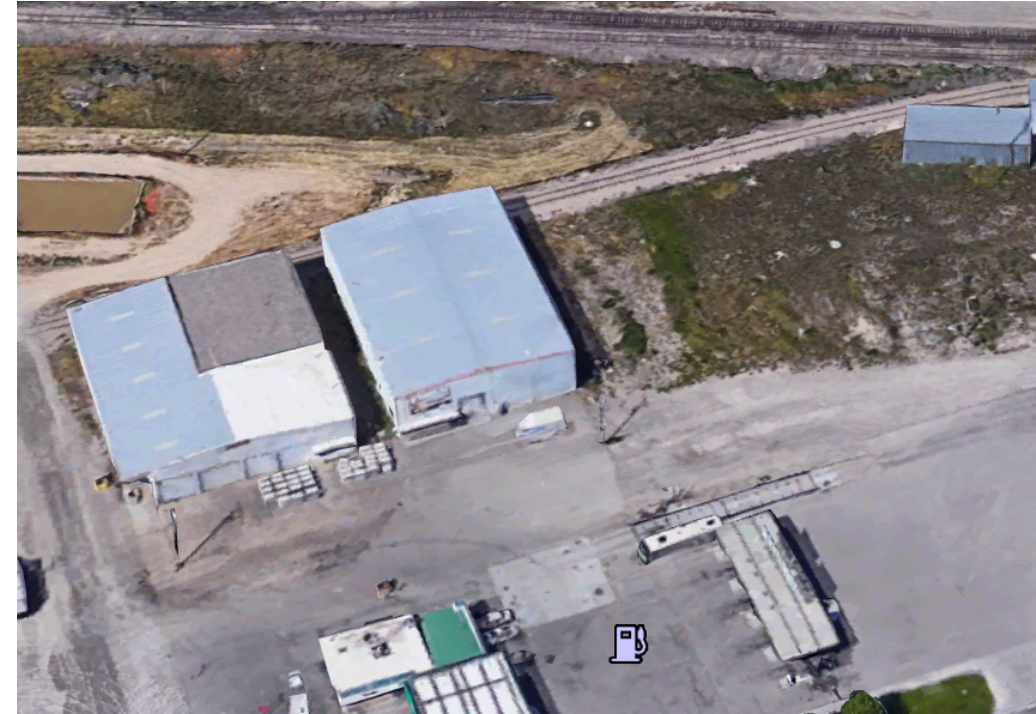
...lgps control dgn\13-2n37e83.dgn Apr. 20, 2015 14:50:53